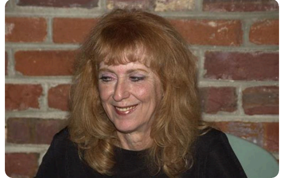
Donfest 2006 Great Memories and Love of Friends